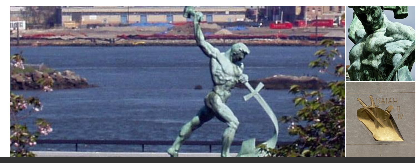
"They shall beat their swords into plowshares, and their spears into pruning hooks."