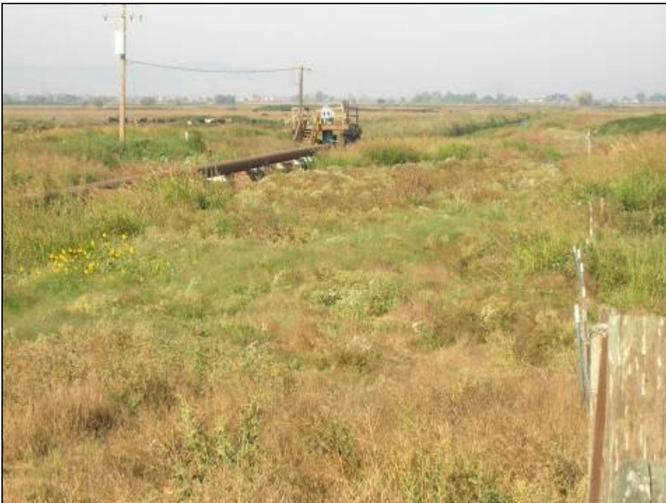
Figure J-3. West bank of the Old River, diked canal perpendicular to the levee road.