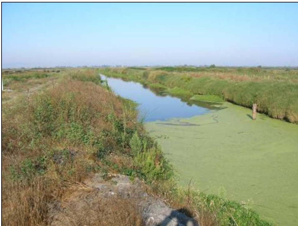
Figure J-4. West bank of Old River, view of diked canal.