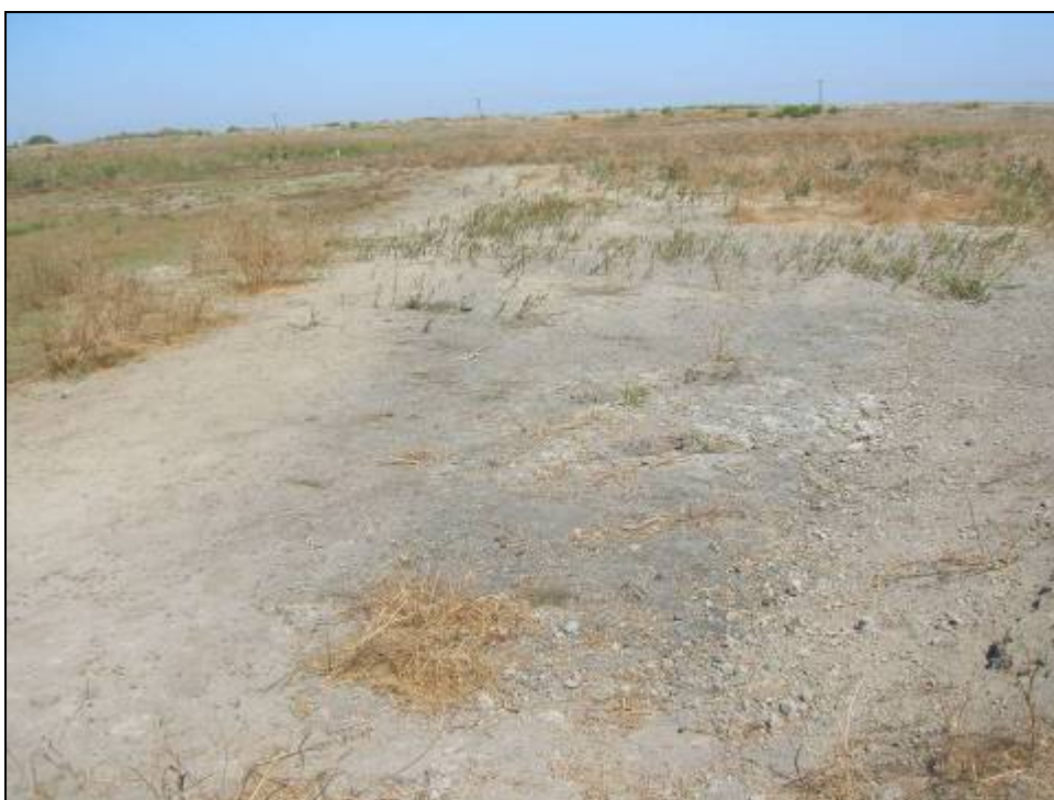
Figure J-5. Seasonal wetland at Connection Slough site.