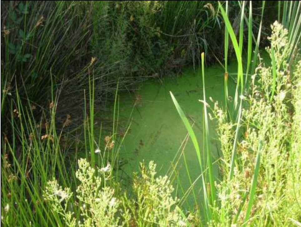
Figure J-2. West bank of Old river, small canal parallel to road.