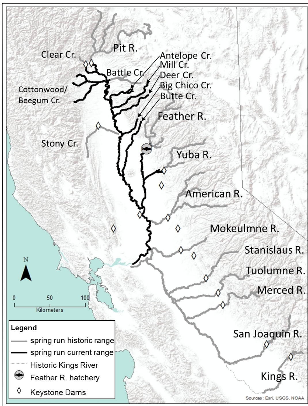
Figure 2 Current and historical Central Valley spring-run Chinook salmon distribution. The current distribution in solid black is overlaid on the historic distribution in light grey. Keystone dams, defined as the first major barrier to anadromy, are shown by open diamonds. Feather River Hatchery is likely to be used as the source population for spring-run Chinook salmon reintroductions to the San Joaquin River.